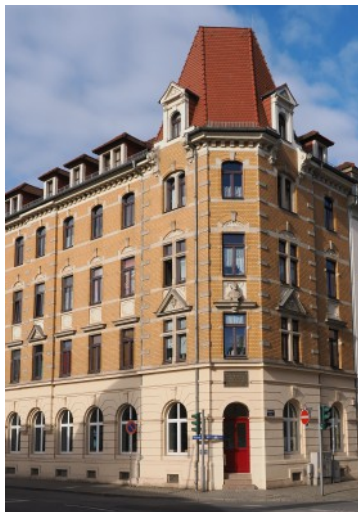
The Hahnemann House

Dear members of the IHZT, dear friends of the life and work of Dr Samuel Hahnemann and early homeopathy!