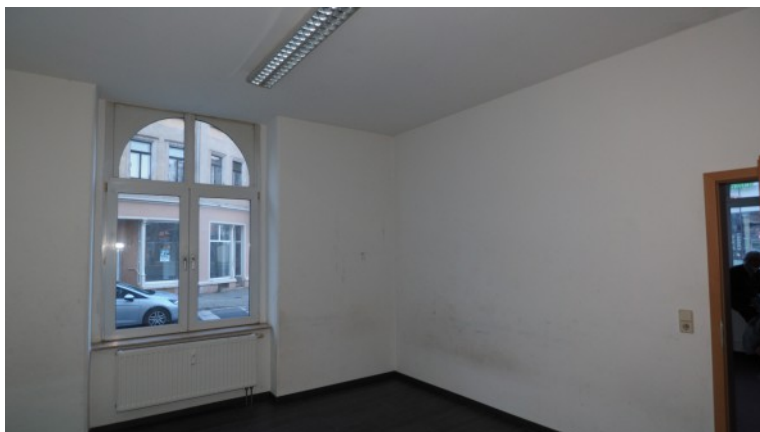
Our cabinet before moving in

on the entire ground floor of the Hahnemann House, and because it is important to the city of Meissen, to also integrate a meeting centre there for the citizens. The concept for this should be developed accordingly. For the Umbrella Organisation of the Hahnemann-Sites, this centre was the absolute focus of the project and the realisation of the Hahnemann exhibition of our association would have been completely crippled in its implementation. This was the cause of the rather heated dispute.